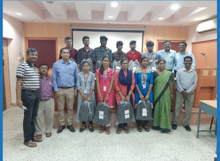
Laptop and Books Distribution to Last year's inducted students on 5 th Nov, 2019